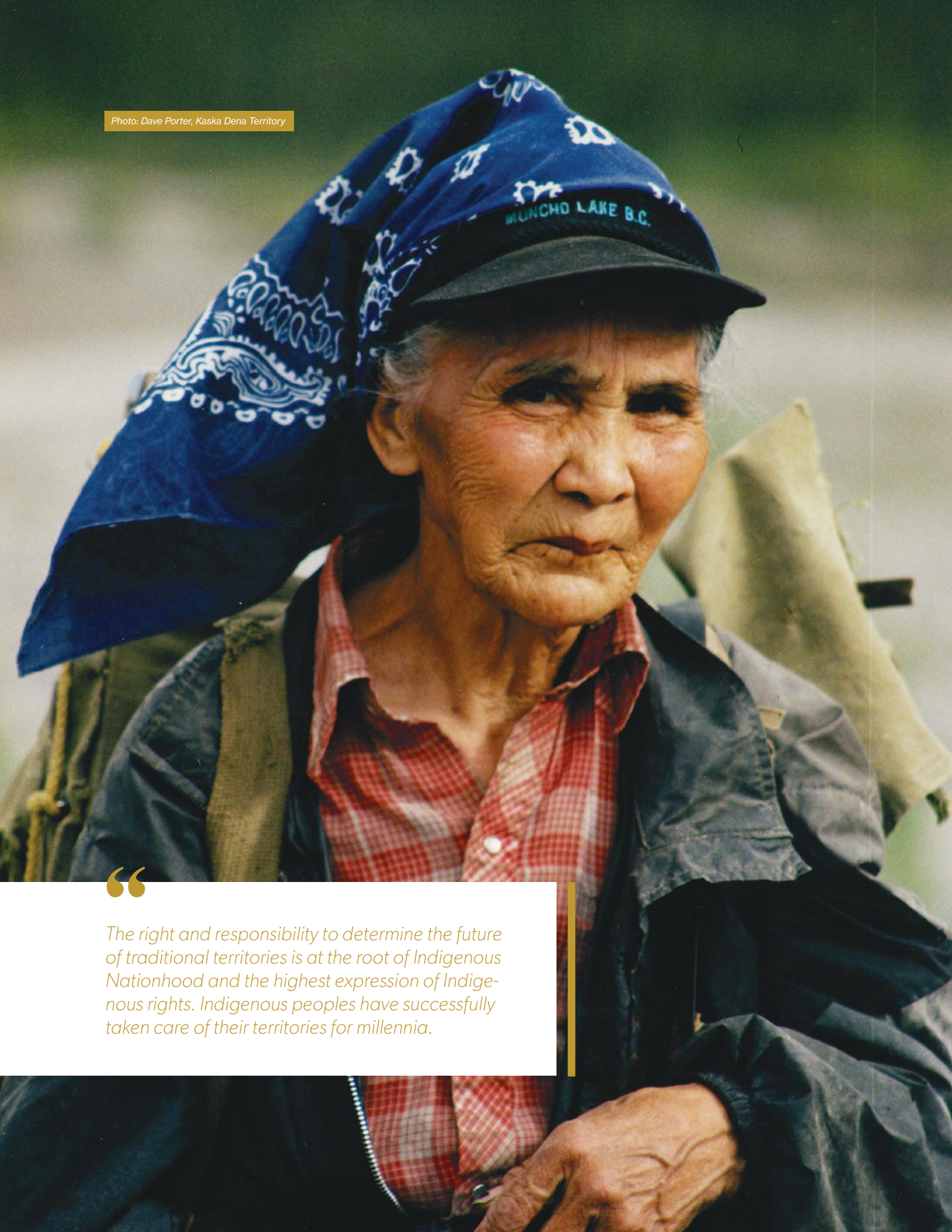
Kaska Dena Territory