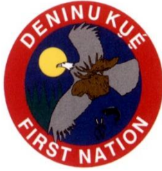
Deninu Kue First Nation